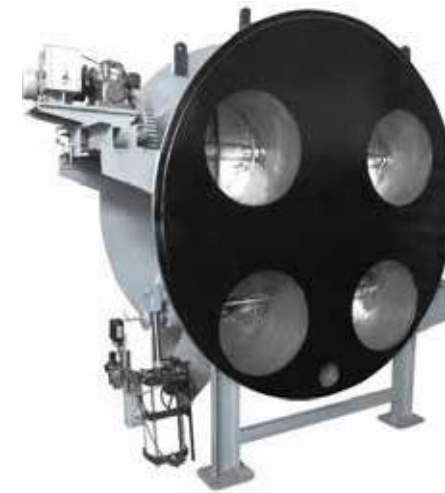
GROUP EXPANDING VALVE DN 2700