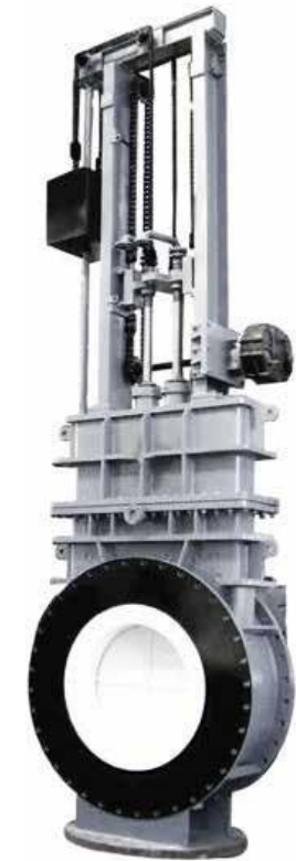
HOT BLAST VALVE DN 1100/1600